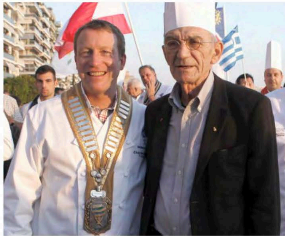
Chef [2007] and Tasting Success [2010], which are being used in culinary schools all over the U.S. and around the world.

It's also exciting to reinvent myself, something I think we all need to challenge ourselves to do from time to time. For example, I've been able to get back to writing, which I love. I really enjoyed the process of my first two books, Leadership Lessons from a